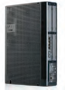
SL2100 Communications Server