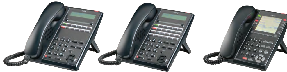
SL2100 Multi-line Terminals